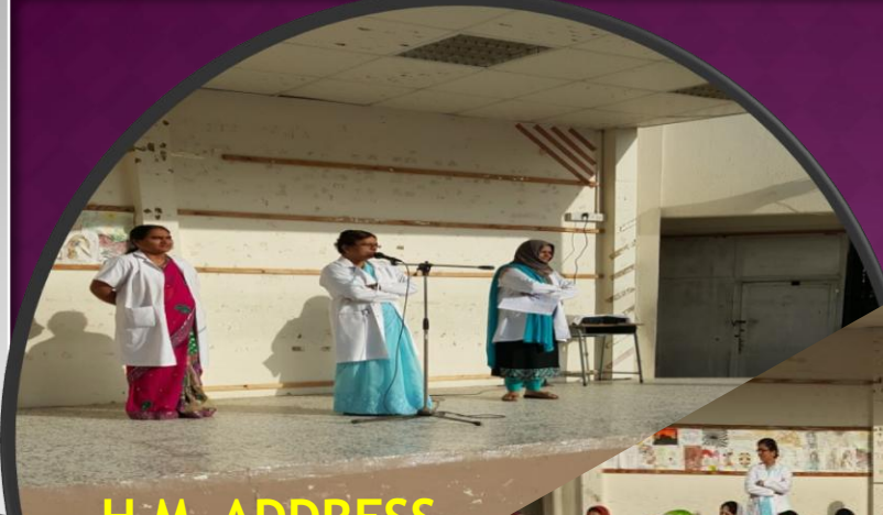
H M ADDRESS